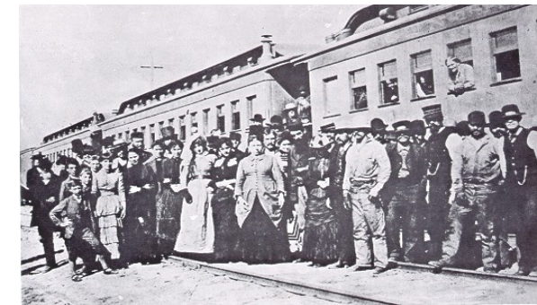
Settlers traveling West on the railroad, a typical sight during Los Angeles’ population boom.