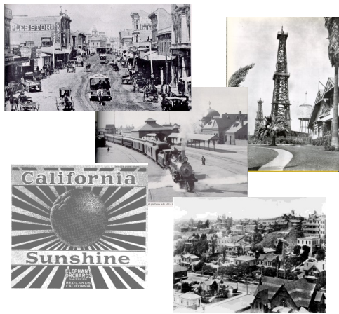
The oil, agriculture, and railway industries were instrumental in the growth of Los Angeles.

Our program, has been specially designed to promote historical and social literacy through architecture, art, literature, mathematics, and living history exhibits. Currently, the program is for third through fifth grade students and special attention has been paid to ensure that the materials meet the California Department of Education Standards for the grade levels.