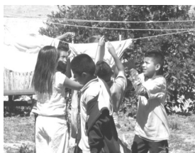
Students taking part in a laundry demonstration.